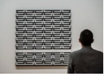
Above 1st: Auckland Art Gallery Above 2nd: Vivid Visual Education