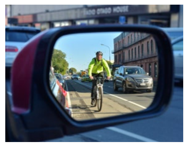
Cycle helmets are compulsory on New Zealand roads