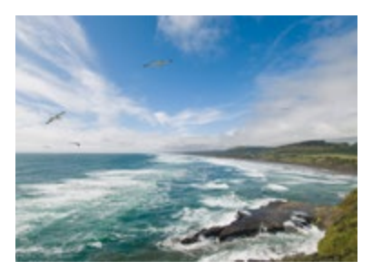
Above: Rangitoto Left: Muriwai